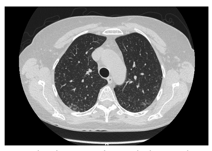
Fig. 1. High-resolution computed tomography chest image showing numerous small pulmonary nodules in the lung apices bilaterally.

We describe a case of a 58-year-old female who presented with complaints of dyspnoea on exertion and persistent non-productive coughing for 3 months. She also complained of dyspepsia and nausea. Her history was otherwise significant only for being on treatment with lamotrigine and donepezil after a diagnosis of frontal lobe syndrome secondary to previous traumatic brain injury. She was a nonsmoker and did not have any occupational or organic dust exposure that could predispose her to pneumoconiosis or hypersensitivity pneumonitis. Previous operations included Nissen fundoplication. Her family history was not significant. On clinical examination, she looked well. Examination of the chest was unrevealing, and normal vesicular breath sounds were audible bilaterally. Chest X-ray and chest computed tomography (CT) images, however, revealed diffuse micronodular infiltrates in a miliary pattern bilaterally (Fig. 1). Lung function evaluation revealed normal spirometry, with an FVC of 3.03 L (117% of predicted), FEV, of 2.56 L (117% of predicted)