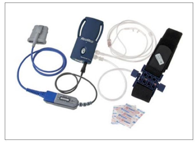
Fig 1. ApneaLink device.

set up, as does a formal PSG, and it can be used easily at home (Fig. 1). Nasal cannulae are inserted, and the small device is strapped to the chest wall, with a pulse oximeter probe on the finger (Fig. 2). The current price for all components, as well as the software programme that analyses the sleep study, is ZAR14 090, discounted for state institutions, while private purchase is around ZAR17 000. The only consumable is the nasal cannulae tubing. Using the device multiple times on inpatients in state hospitals, or provided to private patients, is a more economical sleep study method than using the formal PSG in a sleep laboratory.