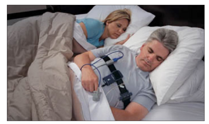
Fig 2. ApneaLink Plus applied to the patient.